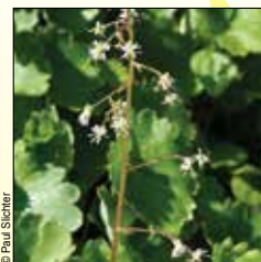
Brook Saxifrage ( Saxifraga punctata )