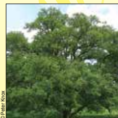
Ussurian Pear ( Pyrus ussuriensis )