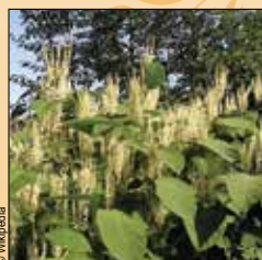
Japanese Knotweed ( Fallopia japonica ) Replace with Bride's Feathers