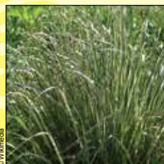
Feather Reed Grass ( Calamagrostis acutiflora )