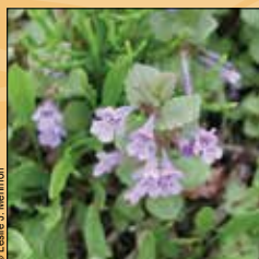
Creeping Charlie ( Glechoma hederacea ) Replace with Bugleweed