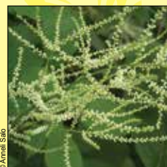
Bride's Feathers ( Aruncus dioicis )