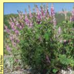
Eskimo Potato ( Hedysarum alpinum )