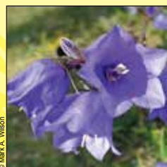
Peach Leaved Bellflower ( Campanula persicifolia )