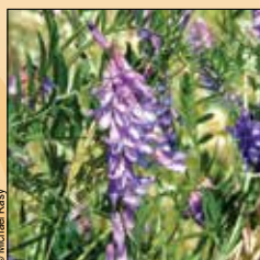
Bird Vetch ( Vicia cracca ) Replace with Eskimo Potato