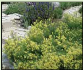
Invasive common toadflax taking over an ornamental flower bed.

Invasive plants like purple loosestrife and common toadflax shown here are often planted for their beautiful flowers, but can quickly spread in and beyond the garden. In the lower 48 states, purple loosestrife has spread from garden plantings to dominate hundreds of wetland acres, displacing native flora and fauna. In Alaska, purple loosestrife has been found beyond its garden planting in a natural area in Westchester Lagoon, where it was quickly managed and is monitored each season.