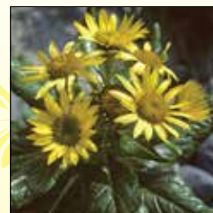
Beach Fleabane ( Senecio pseudoarnica )