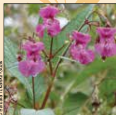
Ornamental Jewelweed ( Impatiens glandulifera ) Replace with Queen of the Prairie