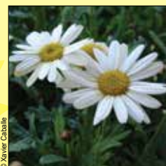
Shasta Daisy ( Leucanthemum maximum )