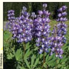
Lupine ( Lupinus nootkatensis or L. arcticus ) Avoid "Bigleaf" Lupine