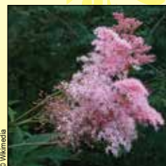
Queen of the Prairie ( Filipendula rubra )