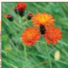
Orange Hawkweed ( Hieracium aurantiacum ) Replace with Pot Marigold