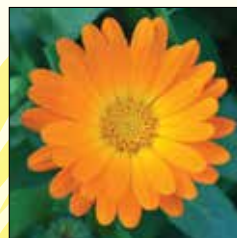
Pot Marigold ( Calendula officinalis )