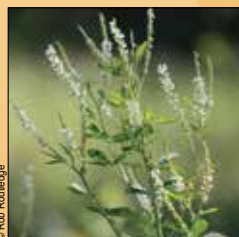
White Sweetclover ( Melilotus alba ) Replace with Fireweed