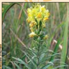
Common Toadflax ( Linaria vulgaris ) Replace with Yellow Monkshood