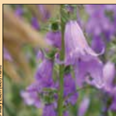
Rampion Bellflower ( Campanula rapunculus ) Replace with Peach Leaved Bellflower