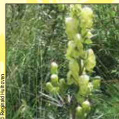
Yellow Monkshood ( Aconitum anthora )