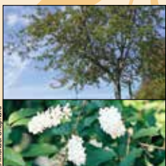
European Bird Cherry ( Prunus padus ) Replace with Ussurian Pear