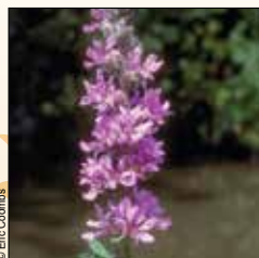
Purple Loosestrife ( Lythrum salicaria ) Replace with Lupine