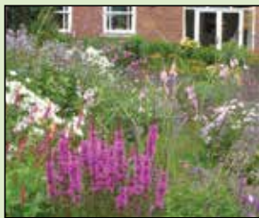
Invasive purple loosestrife planted in a garden.

Some invasive plants have ornamental or medicinal value and are still being sold in nurseries and greenhouses in and outside of Alaska. As gardeners, we may plant these invasives without knowing their growth habit and, once established, they can displace native and desirable vegetation in gardens and in natural areas. Invasive plants can spread by hitchhiking on clothing or fur, being blown by wind, or through aggressive root growth. Gardeners can sometimes unintentionally facilitate this movement by transplanting these plants and sharing them with others.