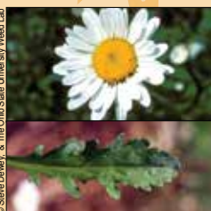
Oxeye Daisy ( Leucanthemum vulgare ) Replace with Shasta Daisy