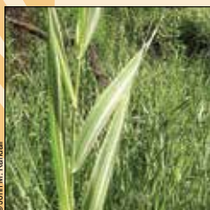
Ornamental Ribbongrass ( Phalaris arundinacea 'Picta' ) Replace with Feather Reed Grass