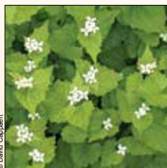
Garlic Mustard ( Alliaria petiolata ) Replace with Brook Saxifrage