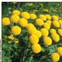
Common Tansy ( Tanacetum vulgare ) Replace with Beach Fleabane